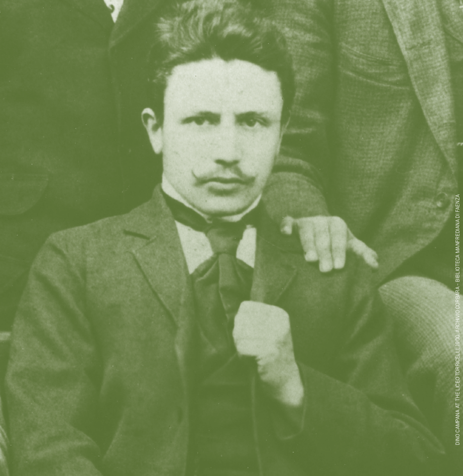
DINO CAMPANA AT THE UGED TORRICELLI 1900 - ARCHIVIO CORRERA - BIBLIOTECA MANFREDIANI DI FIENZA

La fresca incarnazione di un mattutino sogno: E soleva vagare quando il sogno E il profumo velavano le stelle (Che tu amavi guardar dietro i cancelli Le stelle le pallide notturne): Che soleva passare silenziosa E bianca come un volo di colombe Certo e morta: non sai? Era la notte De fiera della perfida Babele Salente in fasci verso un cielo affastellato un paradiso di fiamma In lubrici fischi grotteschi E tintinnare d'angeliche campanelle E gridi e voci di prostitute E pantomime d'Ofelia Stillate dall'umile pianto delle lampada elettriche. Una canzonetta volgaruccia era morta E mi aveva lasciato il cuore nel dolore E me ne andavo errando senz'amore Lasciando il cuore mio di porta in porta: Con Lei che non è nata eppure è morta E mi ha lasciato il cuore senz'amore: Eppure il cuore porta nel dolore: Lasciando il cuore mio di porta in porta.